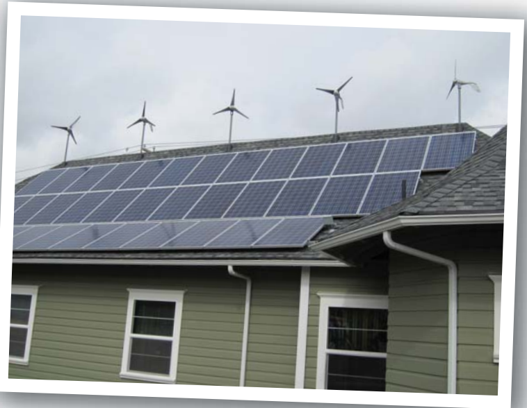
The new Wind Turbines and Solar Panels provide most of Ethos' electricity needs.

Central to Ethos' community-based renovation process has been the idea of creating a model, sustainable green building that would serve as an example and inspiration for our community. As part of this renovation process, Ethos has tackled a number of projects designed to lower the organizational carbon footprint including: installing a 8.39 kw solar panel system, an eco-roof, a rainwater catchment system, 5 wind turbines, over-insulation, double paned windows throughout, energy efficient heating/cooling applications, energy efficient lighting, on-street bike parking, and passive cooling.