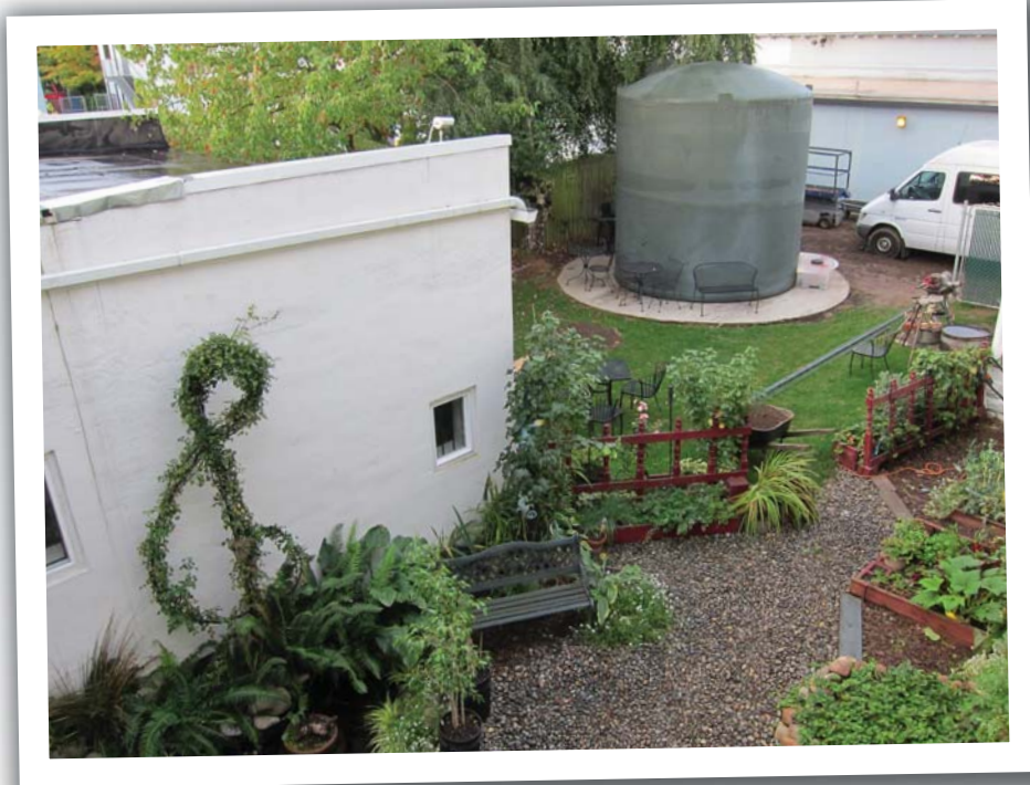
Ethos' rainwater cistern project will reduced potable water use by 90%

filters, and equipment. It also completely eliminates stormwater runoff (estimated at 151,080 gallons a year) from our property while drastically reducing Ethos' dependence on the city's potable water system. This is an important project that aligns with Ethos' commitment to both organizational and environmental stainability.