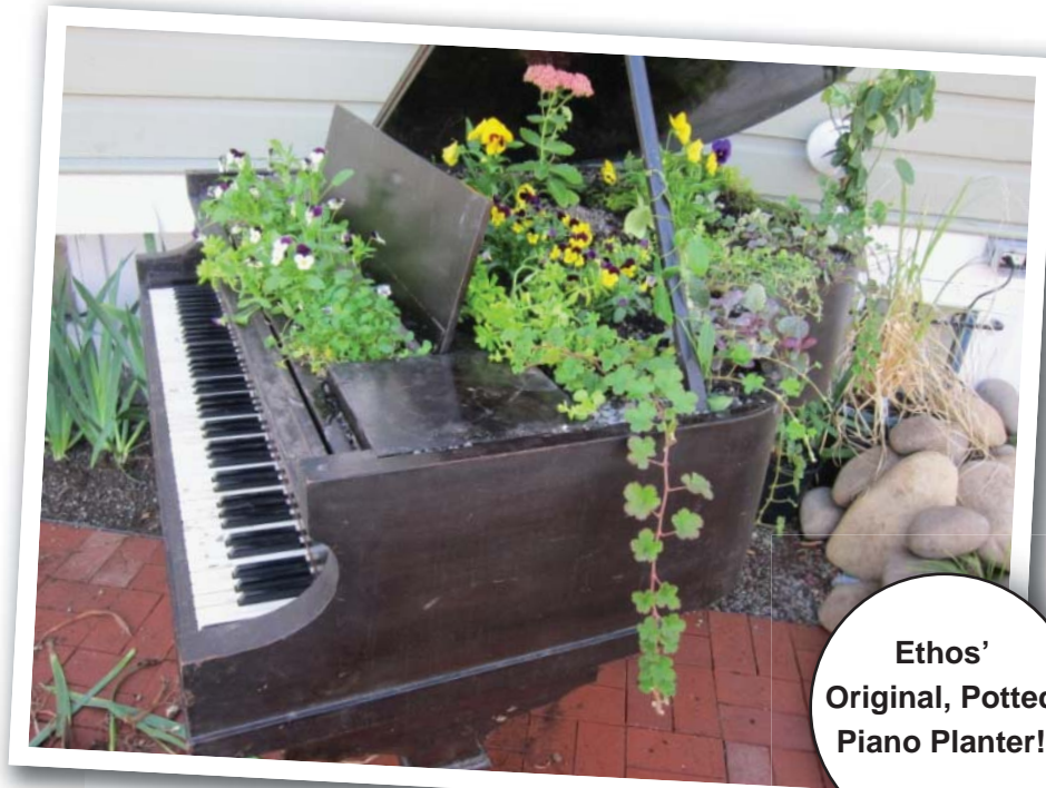
Ethos' Original, Potted Piano Planter!

Ethos' headquarters is located at 2 N. Killingsworth Street (at Williams) in North Portland. The building is accessible via the #72, #44, #6, and #4 bus lines.